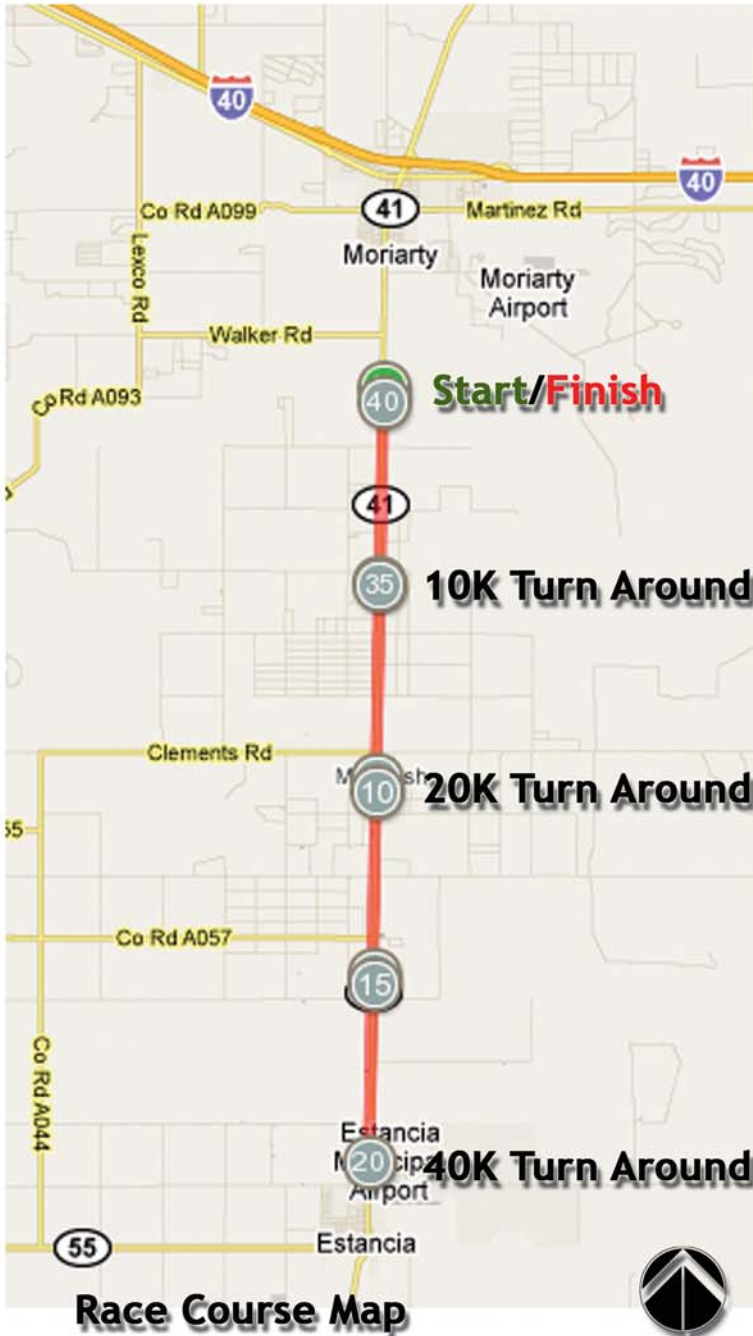
Race Course Map

SEPTEMBER 4 & 5, 2011 MORIARTY, NEW MEXICO